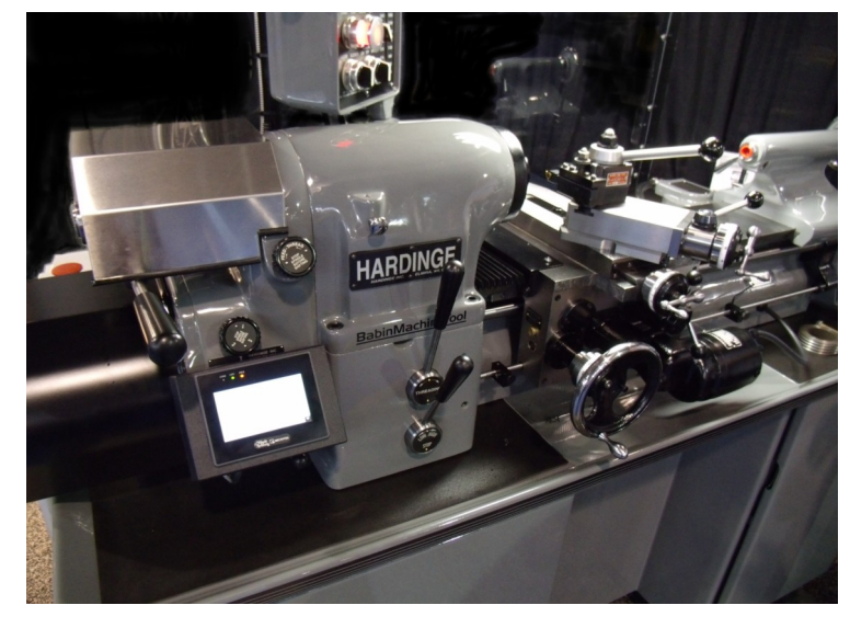
Hard to tell that this lathe is over 25 years old. All slides and surfaces ground for that new lathe look. New factory white dials fitted, spindle collet ID reground, neoprene way wipers replaced, and slide way movement that "feels like glass!" Servo threading system shown.

Also rebuilding: HARDINGE HC chuckers, Bridgeport millers, Monarch EE lathes, surface grinders