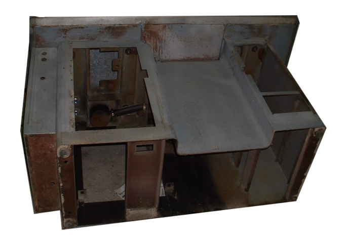
Sometimes we have to check under the hood before painting. Actually, this base is being thoroughly prepped to remove rust and loose multi-layer old paint.