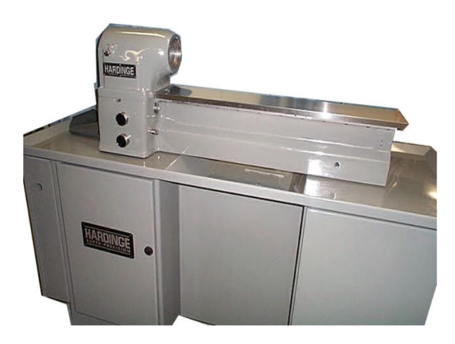
Not quite ready to send back to the customer. Dovetail bedplate was reground & is now ready for the carriage assembly. Polyurethane high-gloss paint looks as new.